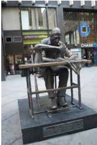
B & J Fabric 525 7th Street