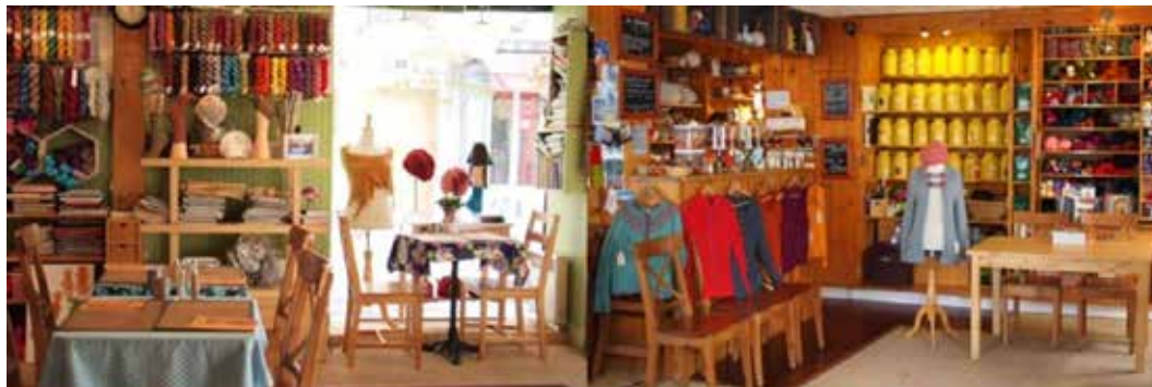
L'Oisive Thè (A combination of a a Yarn and Tea shop) La Butte aux Cailles