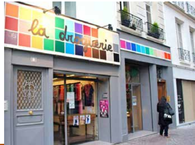
La Droguerie (button, yarn, band and...) Rue de Jour 9-11